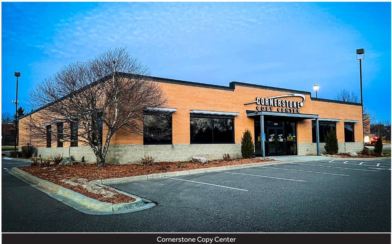
Cornerstone Copy Center