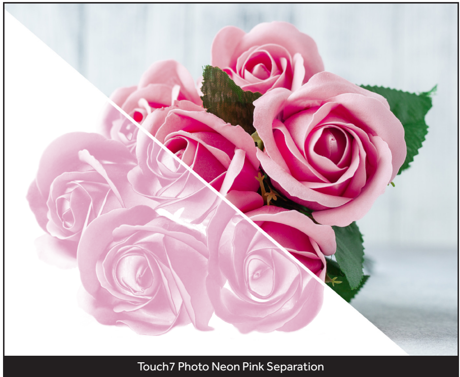
Touch7 Photo Neon Pink Separation