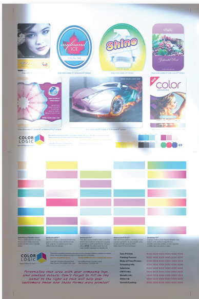
CMYK inks without White Ink, printed on a metallic substrate

Color-Logic research done at recent HOW conferences indicates that graphic designers receive less training and education than ever before regarding the value of print. The Color-Logic marketing kit includes customizable PowerPoint presentations and educational movies for your sales team. Print the two forms below so sales personnel can show prospect the differences between using white ink versus not using it.