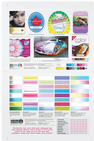
CMYK inks with White Ink, printed on a metallic substrate

CLICK HERE To see a short movie of the effect of using White ink with the Color-Logic system. However, this is no substitute for putting an actual printed copy in a prospect's hands, so we would recommend you print these exact samples for yourself. Please contact us for a copy of our latest Print Evaluation Test Forms.